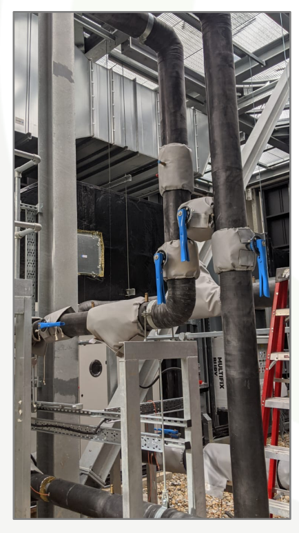
Wood Wharf, London