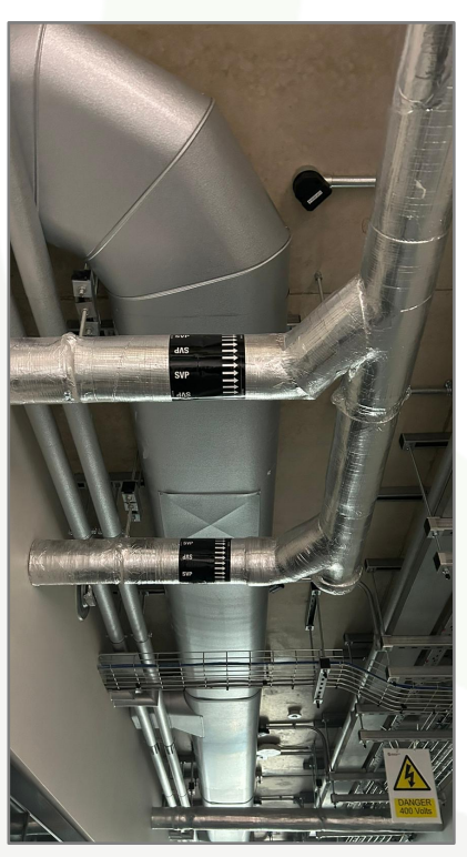
Tower Hamlets Civic Centre